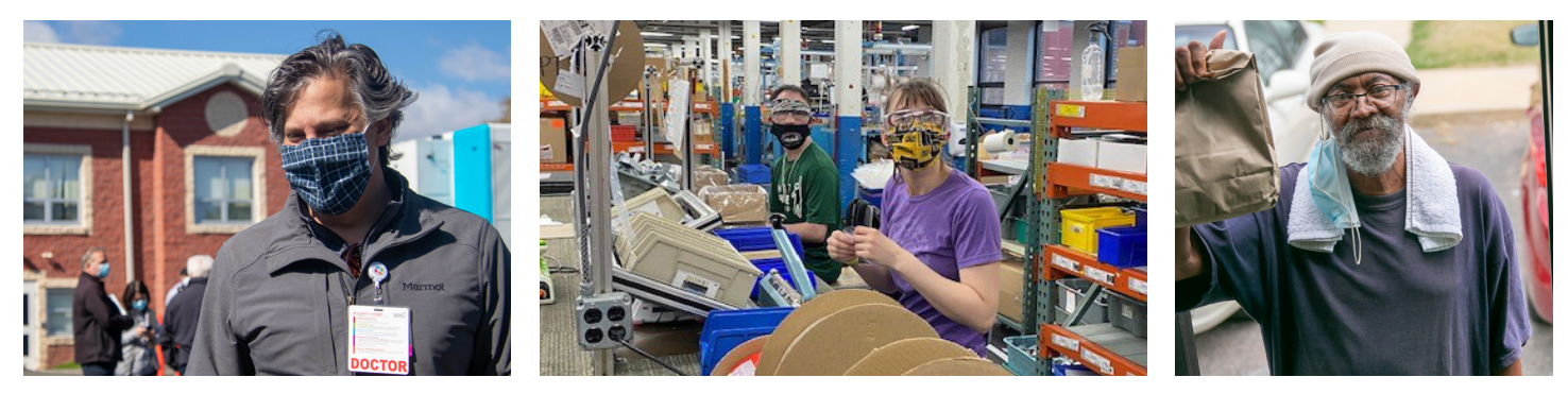
Thank you to our grantees for allowing us to use their photos: CHR (pg. 3), Community Child Guidance Clinic (pg. 5), Community Solutions (pg. 1), Enfield Loaves & Fishes (pg. 2), Favarh (pg. 4, 8), Grace Episcopal Church, Hartford (pg. 7), Hartford Communities that Care (pg. 1, 4, 7, 8), Manchester Area Conference of Churches (pg. 1, 8), Open Hearth (pg. 7), The Village for Families & Children (pg. 1)